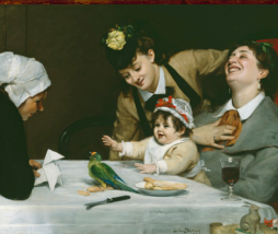
3 Courtyard 1 Merrymakers, Carolus-Duran