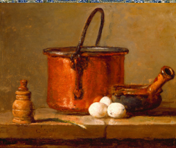
2 Courtyard 3 Still Life, Jean Simeon Chardin