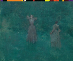
5 North Tower 3 Summer, Thomas Wilmer Dewing