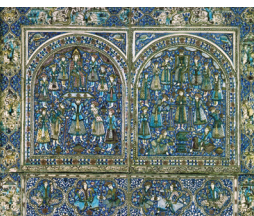
1 Parking Lot Tiled Niche, Unknown Islamic