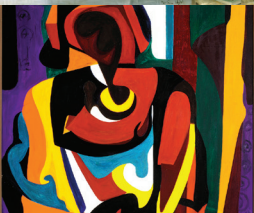
4 Courtyard 2 Mother and Child, Solomon Irein Wangboje