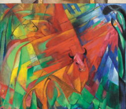
7 North Tower 1 Animals in a Landscape, Franz Marc